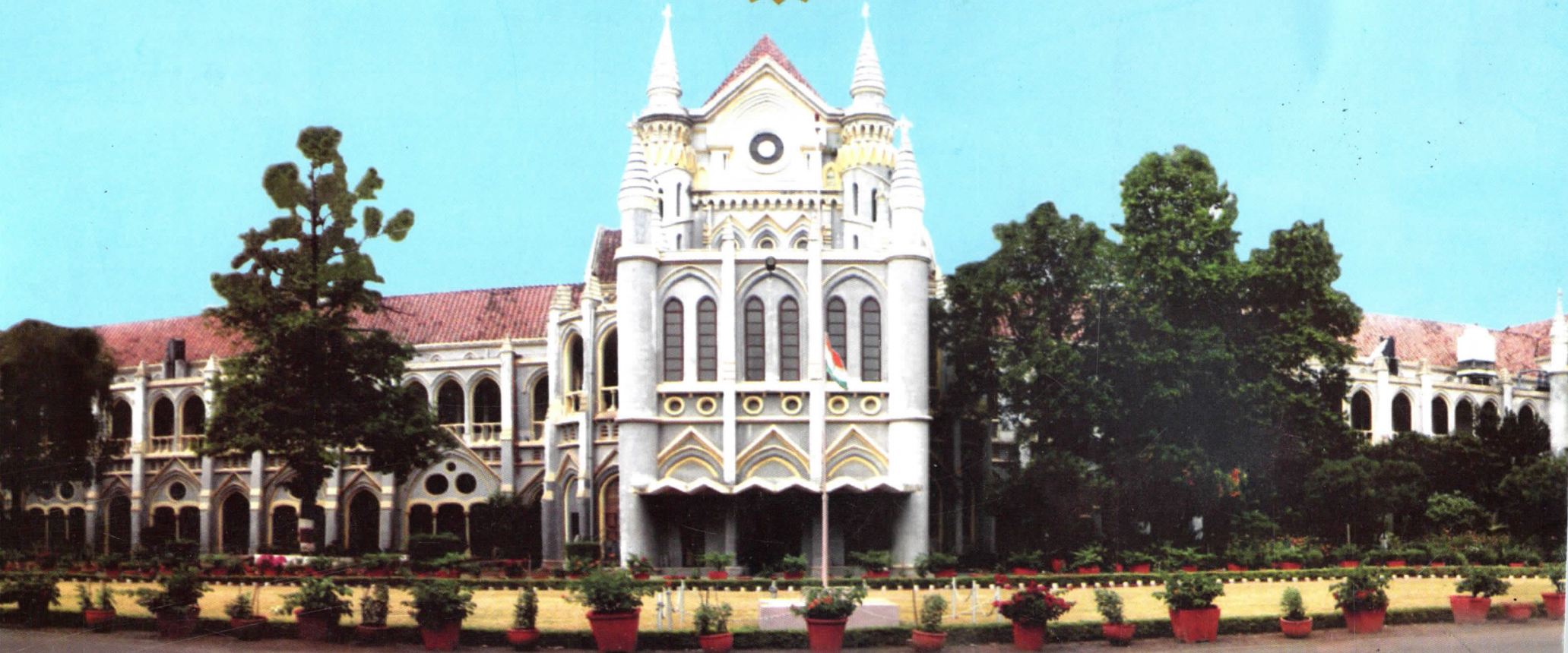
मध्यप्रदेश उच्च न्यायालय, जबलपुर (म.प्र.)